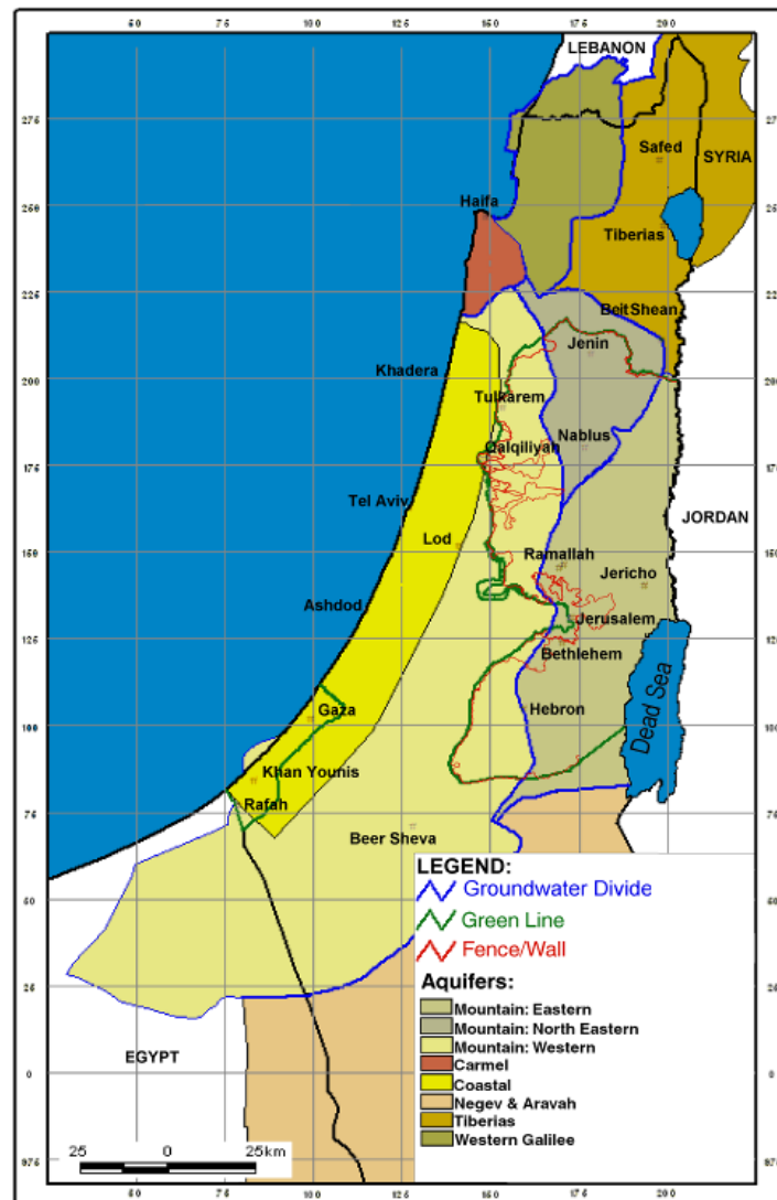
Figure 1. Trans-boundary Israeli-Palestinian water resources.