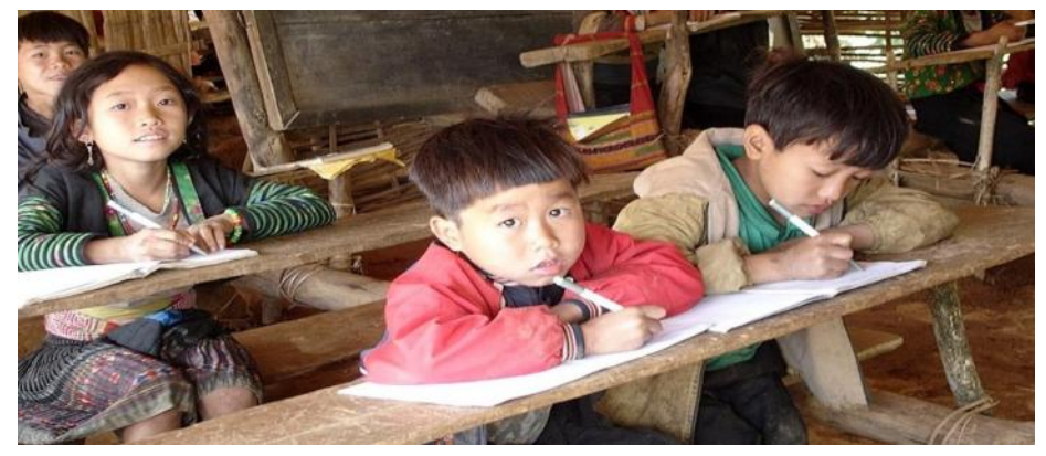
Sustainable development, a rich and complex concept, should be operationalized to give a safe and sound future for our children.

ment and serve as a driver for implementation and mainstreaming of sustainable development in the United Nations system as a whole.