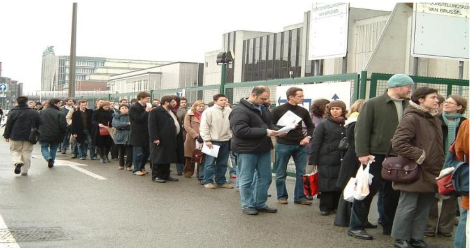
Unemployment line: Unemployed citizens in Europe lining up for unemployment benefits. Most developing countries cannot afford such benefits—it is a better strategy to ensure full employment.

(This paper was written by Martin Khor, Executive Director of the South Centre.)