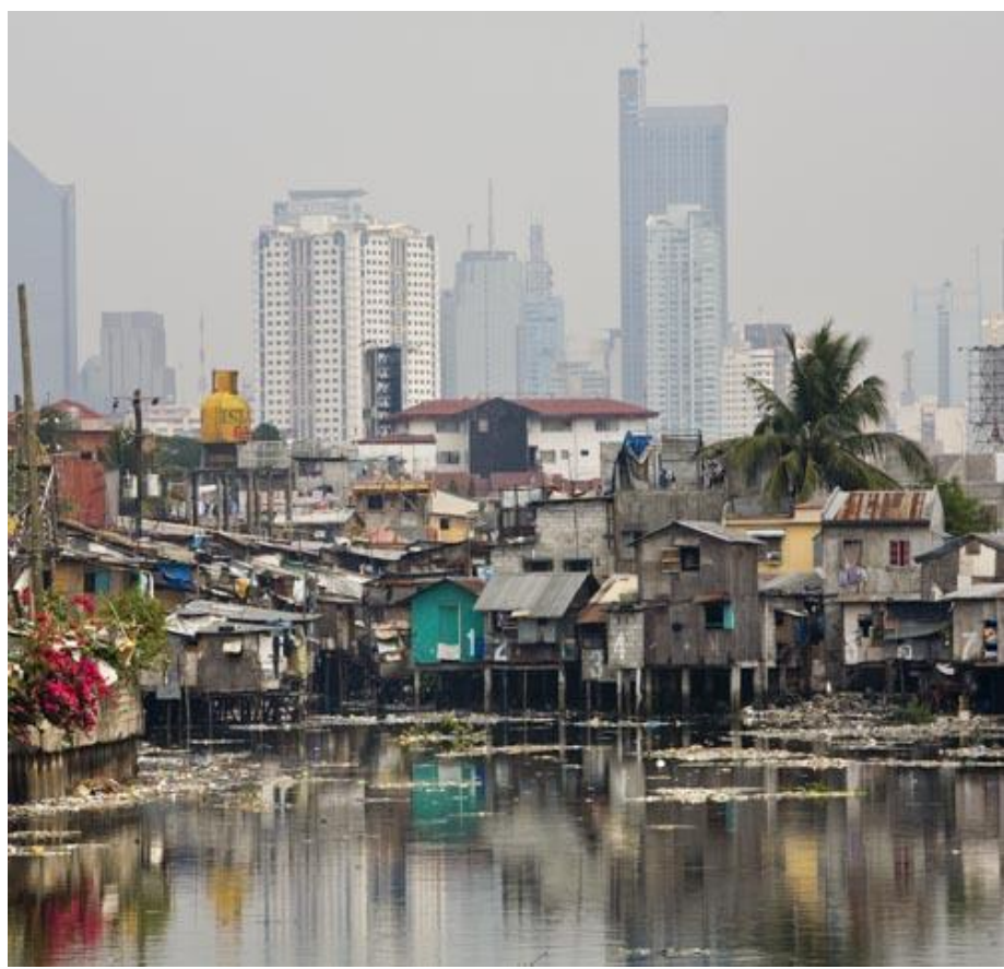
Slum houses in an unhealthy environment co-existing with modern high-rise buildings is a stark contrast that depicts poverty and inequality -- two issues that should have priority in the Development Agenda.

Without this, progress in human and social development would naturally depend on external and domestic transfer mechanisms - that is, aid and redistribution of public spending, respectively. Since there are limits to such transfers, social progress cannot go very far without an adequate pace