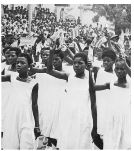
Children take part in Independence Day celebration in Togo in 1960: The struggle for de-colonization continues in many developing countries.

The availability and cost of medicine, the overwhelming proportion of which is still sourced from developed countries, has been a sore point for developing countries for a long time. Moreover, too much (as compared to the afflicted population) research and medical production are oriented toward diseases and maladies in the developed countries. Should there be agreed global goals in terms for the "right" kinds of medicines and their affordability? Which parties should accept these goals as their obligation?