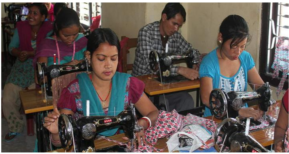
Full employment should be a top-priority goal of the set of SDGs and for the Post-2015 Development Agenda.

This paper first stresses the global dimension (what developed countries and international organisations can do for developing countries) in each goal, then addresses national level efforts, and concludes with means of implementation (finance and technology).