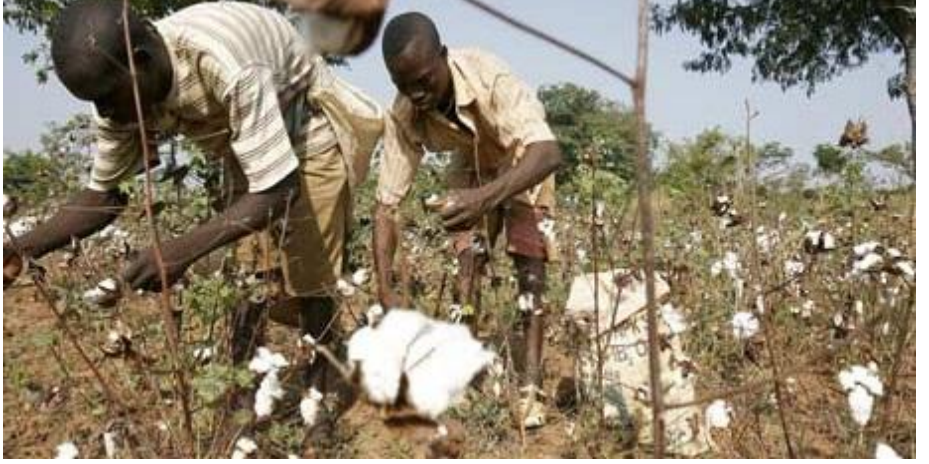
Farmers in Ivory Coast hand pick cotton. These poor cotton farmers would have a better income if cotton subsidies in rich countries are reduced or eliminated.

There are still massive amounts of subsidies and supports provided by the developed countries. According to OECD estimates, the subsidies given to farm producers in all OECD countries