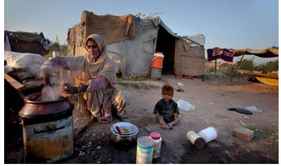
For some families in the developing world, home is a shack and kitchen is in the open compound. Poverty eradication must be a central concern of the SDGs, and the global factors must also be addressed to make the national policy measures possible.