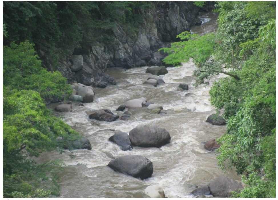
The Gualcarque River.

Neighbors explain the family accumulated land in Rio Blanco through coercion and intimidation. The Honduran State was complicit in the forcible land purchases by this family as police and other officials never responded to complaints of the abuses. The granting of titles under these conditions constituted a violation of the Municipal Law of 1990 and the International Labor Organizations' Convention 169, ratified by Honduras in 1994.