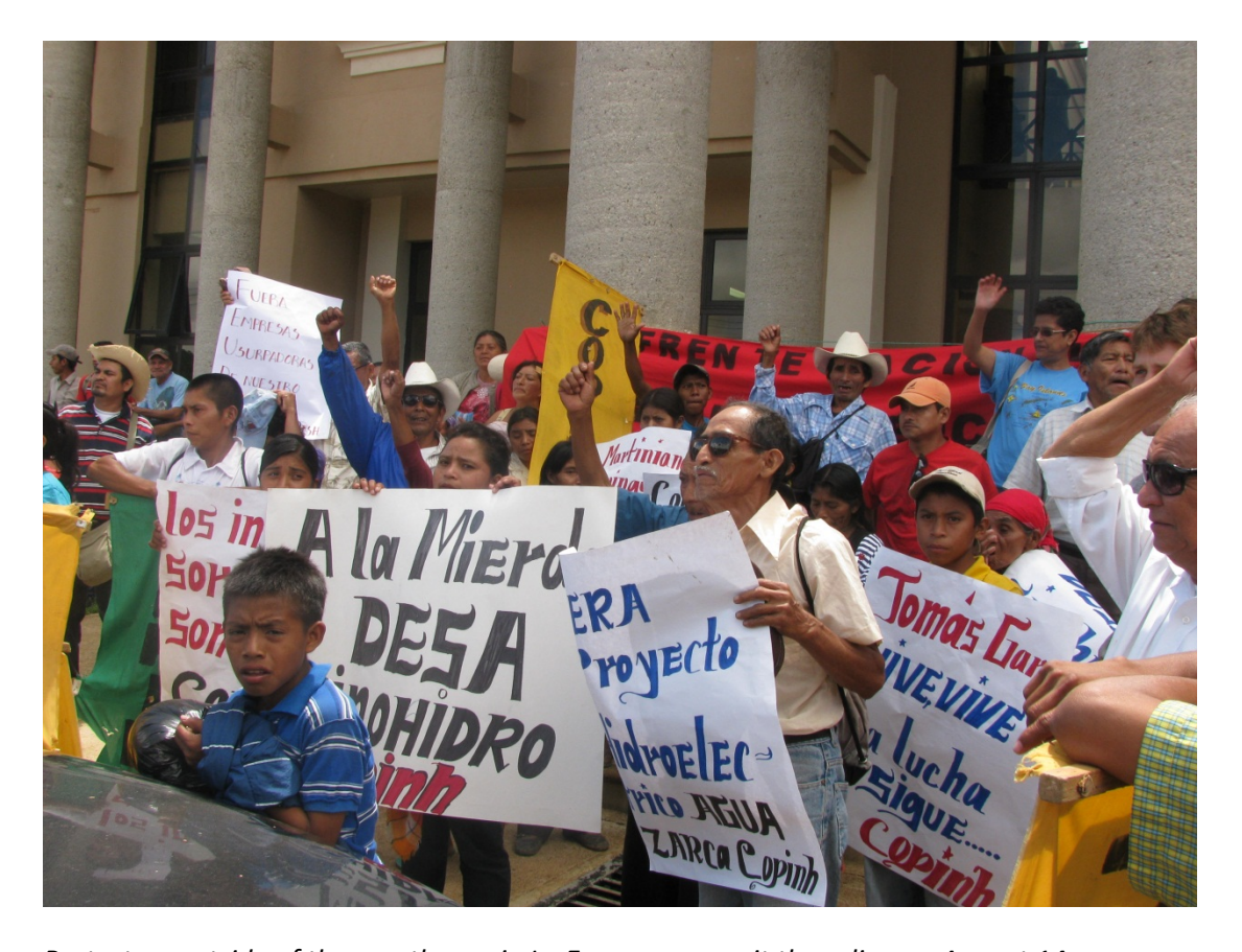
Protesters outside of the courthouse in La Esperanza await the ruling on August 14.